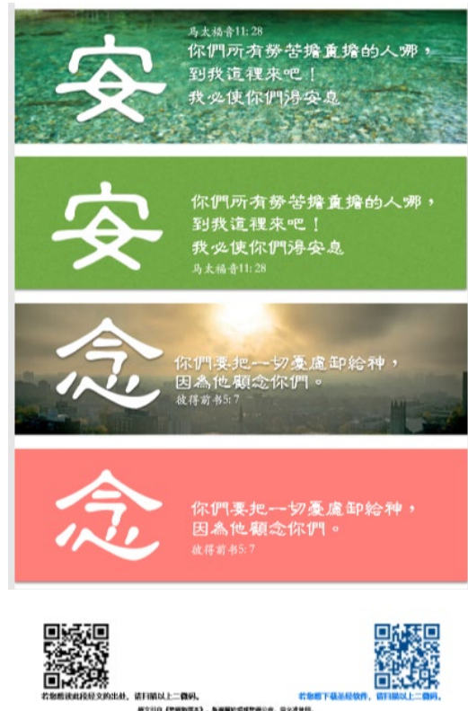
Commissioned bookmark at the Canada Institute of Linguistics

This activity strengthened several conditions for Scripture engagement. By presenting a verse of Scripture in an accessible form, and linking to an available Scripture app, the team strengthened conditions 3 and 5. By presenting a verse of Scripture in a beautiful form, some of the intended audience became interested in learning more about Scripture, strengthening spiritual hunger and freedom to commit to Christ, conditions 6 and 7. The team worked well in partnership with their community, strengthening condition 8.